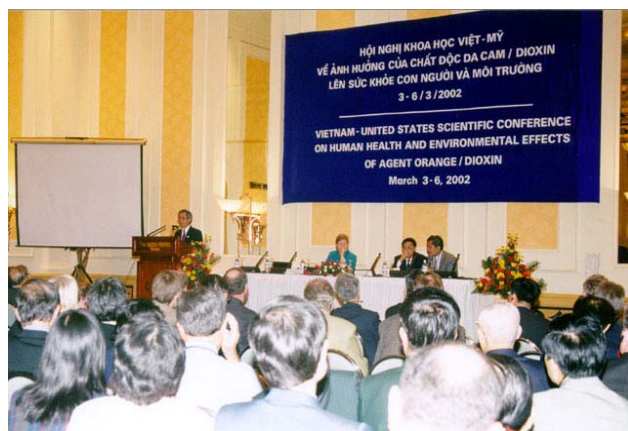
US-Vietnam conference on dioxin in Hanoi

Although environmental protection has been strengthened during the last decade, the Vietnam environment continues to degrade. “The socio-economic development process during the industrialisation period, together with urbanisation and rapid population growth exerts a high pressure on the environment and natural resources. The forest area continues to be degraded and destroyed. Mineral products are still exploited recklessly. Land and soil are being eroded and degraded. Both terrestrial and marine biodiversity have gradually been depleted. The surface water and ground water resources are more and more polluted and face the risk of depletion in some regions. Water pollution has also started to occur in coastal areas. The environment around many urban centres and industrial areas has been polluted by wastewater, emissions and solid wastes. Environmental sanitary conditions in rural areas are still very poor...” (8)