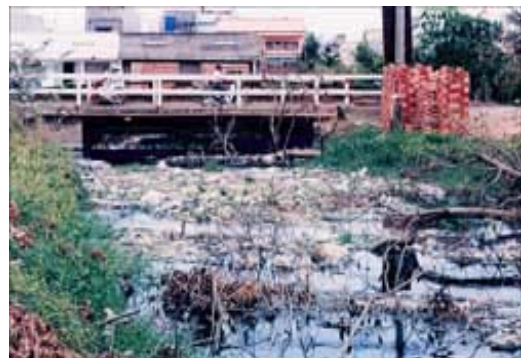
Floating trash in canals

Lack of an adequate collection and disposal system has encouraged illegal dumping, especially into canals and rivers causing serious environmental and transportation problems for these waterways (24). In Ho Chi Minh City, approximately 100 tons of trash is dumped into 5 major canals every day, and the total amount of trash floating in these canals was estimated at 53,000 tons (25). At existing sanitary landfills such as Dong Thanh, Tam Tan, and Phuoc Hiep landfills in Ho Chi Minh City, “... there is no liner in the bottom and on the walls, no leachate collection and control or gas system, and no cover layer and no fence on traditional landfills ” (8). As a result, these landfills have become sources of environmental pollution in their vicinities (26,27,28).