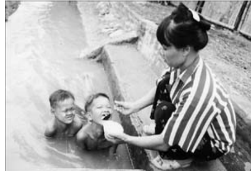
Birth defects caused by pesticides pollution

Chemical pollution has threatened public health and safety and affected the quality of a variety of agricultural products such as meats, seafoods, fruits, and vegetables. The most common threat is food poisoning. In 1998 and 1999, 8,758 cases of pesticides poisoning were reported with 10,034 persons seriously affected and 198 deaths. The numbers increased to 6,962 cases, 7,613 affected persons, and 187 deaths in 2001 (35). Long-term health effects from chemical pollution including death, cancers, and birth defects have been observed and reported (17,36). A budget of approximately 30 million $US was approved for food safety programs in 2003 (37).