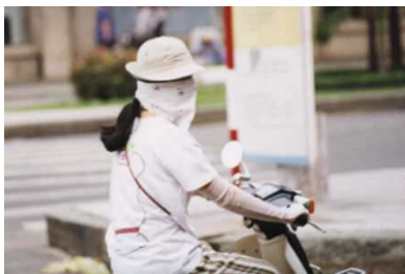
Coping with air pollution in major cities

The most common air pollutant in Vietnam is dust. From 1995 to 1999, “... most urban areas in Vietnam are polluted by dust, and some centers are polluted to an alarming degree... In residential areas next to factories or near large traffic roads, dust concentration is often higher 1.3 to threefold the acceptable level. The residential areas near brick and beer plants in Lao Cai town have dust concentration that is fivefold higher than the permitted standard. The places with highest levels of air pollution are residential areas near Hai