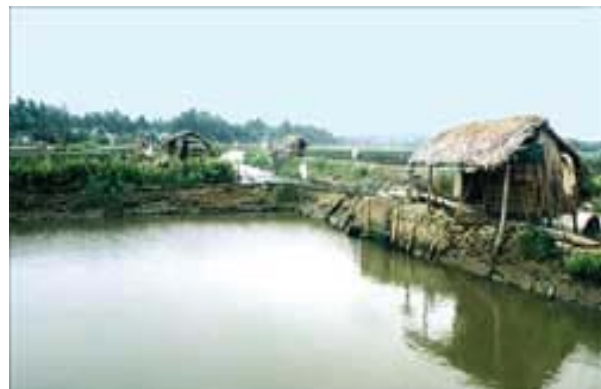
Mangroves converted into shrimp ponds

Deforestation in Vietnam appears to continue at an alarming rate. In the Dak Lak province of the Central Highlands alone, the area of