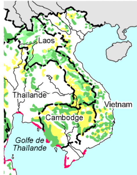
Forest cover in 1990

Vietnamese government officials and some researchers have pointed to the wars as the primary factor for deforestation in Vietnam. In fact, “... from 1945 to 1975, almost uninterrupted warfare resulted in the destruction of most of the remaining forest and farmland, giving rise to a new word – ecocide... American and Vietnamese scientists estimate that 22,000 square kilometers of forests and one-fifth of the country’s farmland were affected as a direct result of bombing, mechanized land clearing and defoliation” (5).