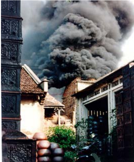
Air pollution from factories in urban areas

Phong cement plant, VICASA plant (Bien Hoa), Tan Binh industrial zone (Ho Chi Minh City), and Hon Gai coal select plant (Ha Long City)" (8). "According to the 1995 World Bank report, dust from cement factories coats much of Hai Phong, the third-largest city, exceeding government air standards by three to eight times." (3).