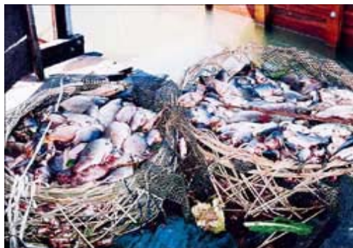
Aquacultural fish killed by water pollution in Dong Nai River

The environmental pollution has already shown its impacts on the social and economic development in Vietnam. Water pollution has reduced availability of fresh water, killed aquacultural fish in rivers (29,30), and damaged crops and plants along polluted canals and rivers used as sources for irrigation water (31). “ The World Bank is soliciting bids for a $150 million project to build new raw water mains, expand and update treatment plants, and lay distribution piping in four large cities ” (3). Because of the use of chloramphenicol and nitrofurans to cope with water pollution, “... the Vietnam’s seafood industry has lost scores of US dollars recently ” (32). Costs for