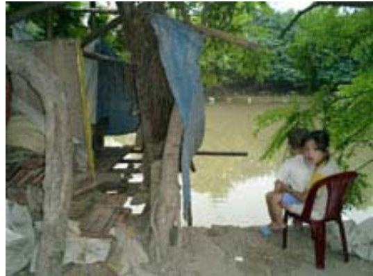
Restroom over water

In rural areas, according to Dr. Quy Vo, agricultural activities (including aquaculture and flood control structures) are causing “a serious problem with water pollution in many regions of the country” (3). Surface water has been polluted with nutrients and coliforms from fertilizers and human and animal wastes. “According to a report from the Ministry of Agriculture and Rural Development, the value of fecal coliforms, averaging between 1,500 and 3,500 MNP/100 ml [MPN/100 ml] along the Tien and Hau Rivers, increases to between 3,800 and 12,500 MNP/100 ml [MPN/100 ml] in irrigation and drainage canals” (11). Current international water quality standards require that no coliforms are present in drinking water.