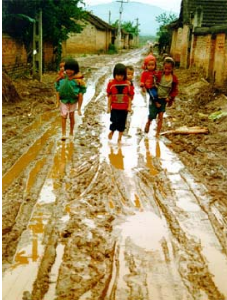
A new road to future

Development and environment are interrelated to each other. Improper or uncontrolled development is likely to cause adverse impacts on the environment, and environmental pollution or degradation may become a major obstacle for social and economic development. The interrelationship between development and environment has been observed throughout the world, especially in fast-developing countries such as Japan, South Korea, China, and Thailand (1,2). Recognizing detrimental effects of environmental pollution and degradation on sustainable development, the United Nations Conference on Environment and Development, which was held from June 3 through June 14, 1992 in Rio de Janeiro, Brazil discussed and agreed on several global environmental issues including non-binding statements on the relationship between sustainable environmental practices and the pursuit of social and socioeconomic development. One of these agreements was Agenda 21, a wide-range assessment of social and economic sectors